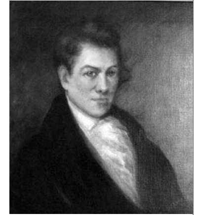
Alabama's third governor, Israel Pickens.