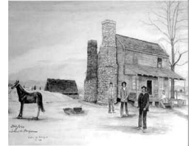
Colbert's Stand is located on the Natchez Trace in Alabama.

The Natchez Trace was a 444-mile trade route that cut completely through the Chickasaw Nation from Natchez to Nashville, Tennessee. Several inns (or "stands")